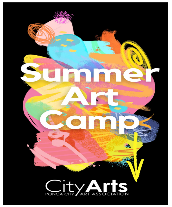
Join us for Ponca City's longest running youth art camp!