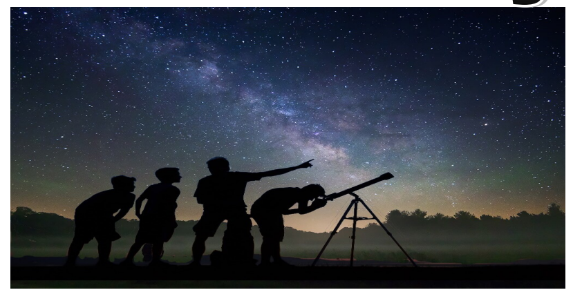
Ponca City Astronomy members will set up telescopes for the public to view the moon and planets or other sights in the night sky!